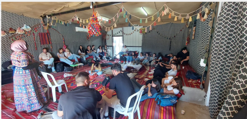
Pre-Army academy students meeting with Bedouins in the Negev