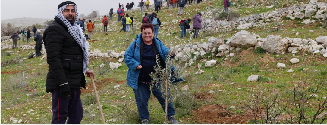
Volunteers planting trees in the West Bank

"Man is like a tree in the field" Deuteronomy 20:19