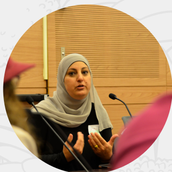
Activists speaking at the Knesset, June 2023